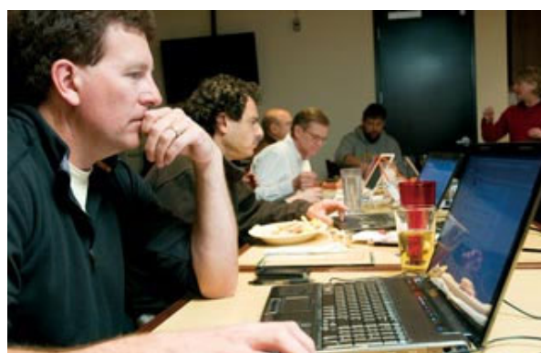
Twitter Boot Camp hosted by the DaVinci Institute; Photo by Rob Hammer

In this new digital landscape of social networking, a little PR stagecraft still goes a long way, Nagler notes. "Your message is lost in a sea of status updates if you're not careful," she says. Beyond the need for a bit of creative wordplay, this is a duty that cannot be easily outsourced. Authenticity is critical. "With something like Twitter or personal status updates, they have to come from you and they have to